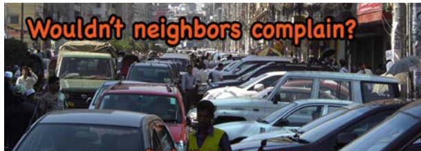
Wouldn't neighbors complain?

WHEN YOU DO THE MATH, THE NUMBERS JUST DON'T ADD UP!