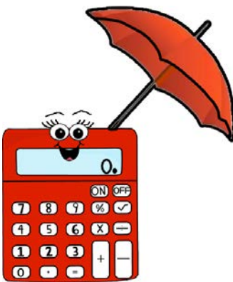
MISTRESS OF THE MIGHTY CALCULATOR

ADDITIONAL OPERATION CROSS COUNTRY STING INFORMATION FOR YEARS 2000 TO 2015 WILL BE ADDED AS I COMPILE THE INFORMATION. PLEASE SEE PART I FOR USER INFORMATION