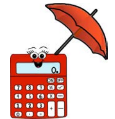
MISTRESS OF THE MIGHTY CALCULATOR

PLEASE NOTE: THE STATE TOTAL POPULATION AND THE MALE AND FEMALE POPULATION MAY NOT ADD UP - TAKEN FROM TWO DIFFERENCE SOURCES: STATE TOTAL POPULATION INFORMATION IS FROM TABLE #5/ STATE BY STATE POPULATION BY GENDER IS FROM THE 2010 CENSUS CAN BE FOUND HERE: http://www.factmonster.com/ipka/A0004986.html