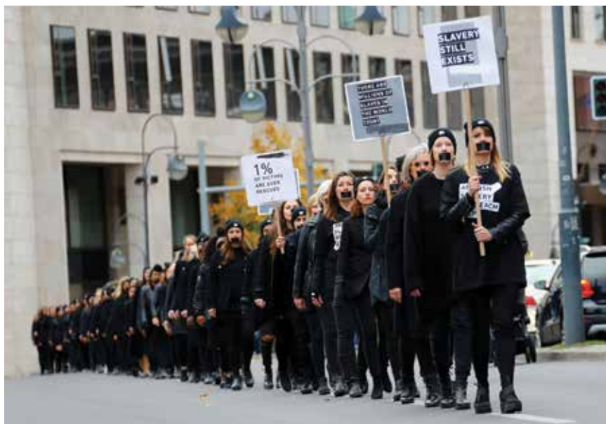
Activists take part in a ‘Walk for Freedom’ to protest against human trafficking in Berlin, Germany, October 20, 2018.

We have questioned the preoccupation with “guesstimating” the number of victims nationally and worldwide. Some analysts consider this an inherently flawed exercise, given the clandestine nature of much trafficking and slavery. Recall that the U.S. State Department has now abandoned numerical estimates and instead simply notes that there are “millions” of victims worldwide. It can be argued that resources should be shifted downward: away from costly big-data quantification of trafficking and slavery at the macro level toward sponsoring micro-level research in specific cities and with distinct victim populations, as IOM does. Such research on the ground has important policy and enforcement implications: When findings pinpoint specific “hot spots” of victimization, they can help the authorities locate perpetrators and disrupt trafficking rings and slave-based enterprises.