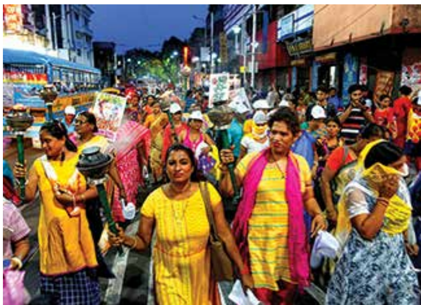
Sex workers of Sonagachi Kolkata, West Bengal, India, the Largest red light area of South East Asia, took part in a torch rally April 30, 2019, demanding dignity, labor rights and social protection on the eve of International Labor Day.