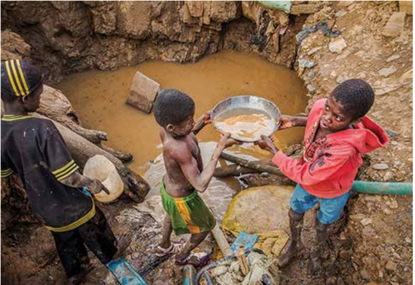
Children fetch water from the bottom of a 25-foot well. At the surface, they use the water to pan for gold.

H uman trafficking and modern slavery have become major public issues over the past two decades. Almost every nation has enacted laws criminalizing human trafficking, and international organizations, governments, and NGOs sponsor a large variety of projects to curb trafficking and slavery. Billions of dollars have been allocated to these efforts. Between fiscal years 2001 and 2010, for example, the U.S. government spent more than $1.45 billion on domestic and international antitrafficking programs, and the funds allocated for FY2019–FY2021 total $430 million. Expenditures by other governments and by international organizations have been substantial as well.