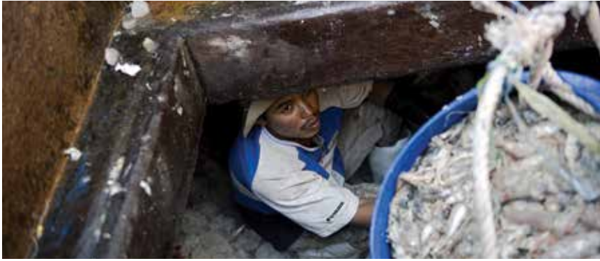
Migrant workers from Cambodia at work on a fishing boat in Mahachai, on the outskirts of Bangkok, Thailand, February 25, 2010.

Since 2002 the Labor Department has issued its Worst Forms of Child Labor Report , which identifies countries that have made progress in fighting child labor, making them eligible for trade-preference programs. The second and more comprehensive international assessment is the State Department's annual Trafficking in Persons Report . The objective is to hold countries accountable for trafficking and to encourage them to adopt a set of best practices for detecting and combatting it. Since 2001, each country receives a detailed narrative evaluation of its record and is assigned a tier ranking, subject to revision if conditions change during the following year: