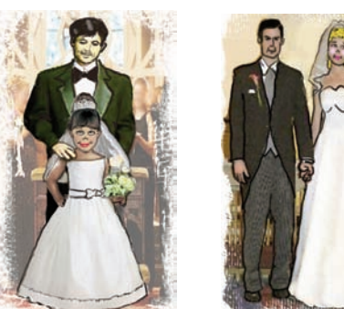
Is there a difference between a child bride and an adult woman who chooses to marry?

abuse, rape and consenting adult sex- how would the police be able to help any of the true victims of these crimes if they were so busy arresting all adults who had sex?