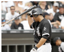
When Danks returns, Sox to go back to 6-man rotation