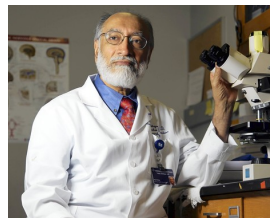
Cause of ALS is found, Northwestern team says