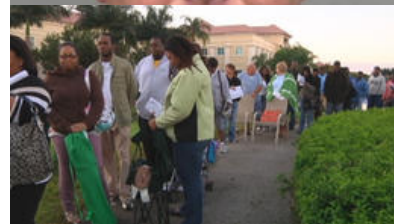
Saturday is the Last Day to Vote Early In Florida