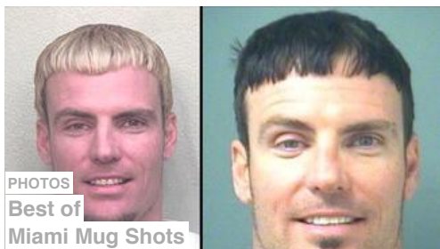
PHOTOS Best of Miami Mug Shots