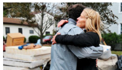
Coming Back From Sandy