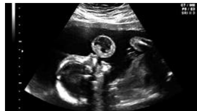
Doctors Reunite With Patients in Fetal Reunion 2012