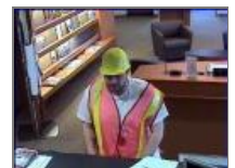
Blue Collar Attempted Bank...