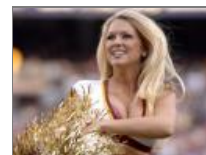
Cheerleaders Of Washington...