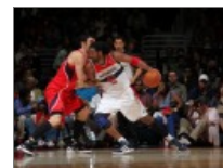
Wizards vs. Hawks