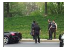
Batman Stopped By Police