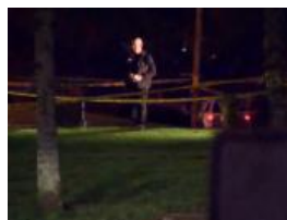
Online photos of dead woman spark investigation in Washington

In one instance, Holtzclaw reportedly forced a 57-year-old grandmother to perform oral sex on him.