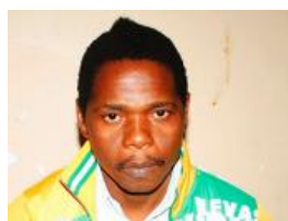
One-armed man convicted of raping 18 women gets 315-years in jail

He was charged this week with three more counts of first-degree rape, two months after he charged with 16 felony counts including first-degree rape, sexual battery, indecent exposure, stalking, forcible oral sodomy and burglary. He also faces one count each of second-degree rape by instrumentation,