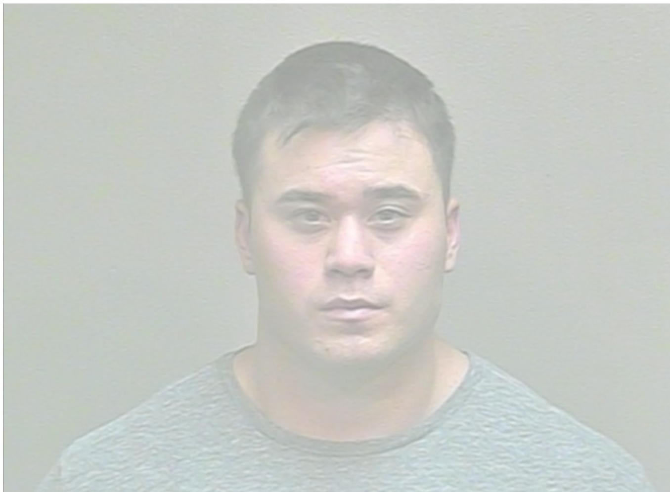
OKLAHOMA COUNTY SHERIFF'S DEPARTMENT

he groped her beneath her shirt and inserted his hand into her shorts and beneath her underwear while they were on her front porch. He then allegedly forced her to perform oral sex and engage in sexual intercourse with him, according to the affidavit cited in The Oklahoman.