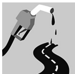
Invitation to a Dialogue: Raise the Gas Tax