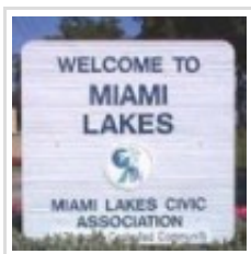
Abuse in Miami Lakes- Need to be Heard