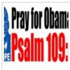
Florida Corrections Officer Suspended For 'Ob...