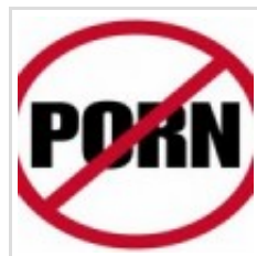
Officer suspended for viewing online porn