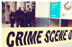
Police Veteran Accused of Robbing a Bank