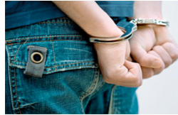
Nine-Year-Old Schoolgirls Arrested And Cuffed