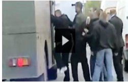
Silent Protesters Get Brutally Arrested By Belarus Secret Police