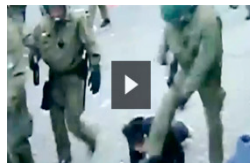
Police Brutality in Germany