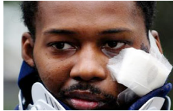
Police Officer Cries On Trial After Shooting Innocent Man