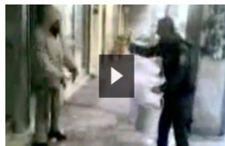
Police Abusing an Homeless Man in Greece