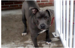
Innocent Young Dog Shot 33 Times By Camden Cops