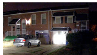
3 Masked Men Storm Home, Initiate Shootout