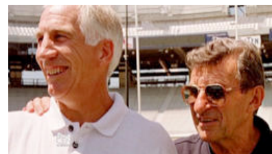
Sandusky Report: No Concern for Victims