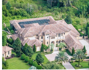
Auction set for Warren Sapp's Windermere home