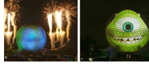
Magic Kingdom set for another 24-hour theme park marathon