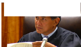
Circuit Court Judge Dexter Del Rosario