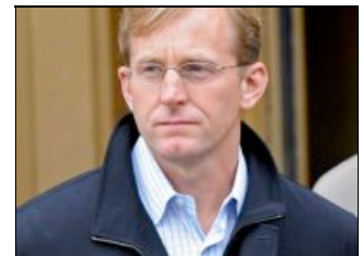
Guilty plea in insider case