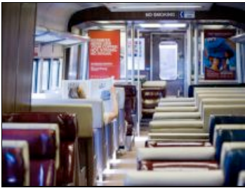
Hearing set for Thursday on Metro-North heat woes

interfering with an investigation, coercion and reckless endangerment. The pleas were made under the Alford Doctrine, meaning he did not agree with all of the state's facts, but realized there might be enough evidence for a guilty verdict.