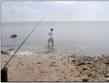
The Dart: Fishing at Stamford's 'quiet' beach