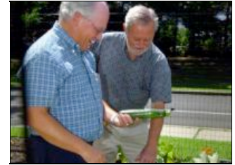
Church grows food for pantry