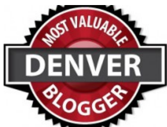
Most Valuable Blogger