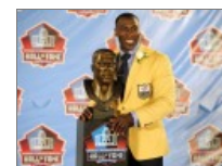
Shannon Sharpe Enshrined In...