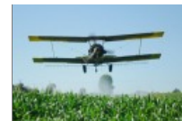
YouReport Photos, Summer 2011