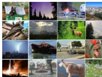
YouReport Summer Gallery