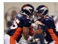
Cowboys 24, Broncos 23