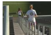
Step Up For Cancer