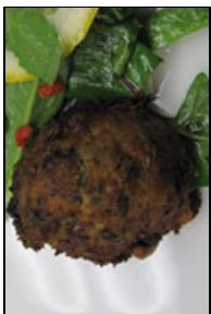
Best Meatball Dishes In Chicago

regrettable that the victim was unable to have her assailant brought to justice due to circumstances that were beyond the control of the Harvey Police Department."