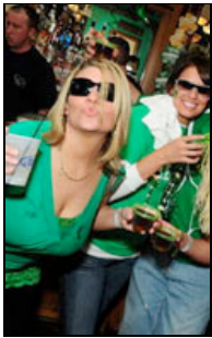
Best Bars To Drink Yourself Green At On St. Patrick's Day