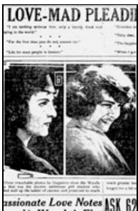
GIRL POWER! Women's History Month At The Chicago Public Library

County Sheriff's office and Illinois State Police. More than 200 untested "rape kits" — evidence collected in sexual assaults — were recovered.