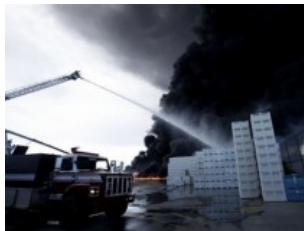
Photos: Fairfield Plastics Fire