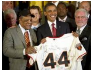
Photos: Giants At The White House