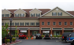
Iron Tiger Martial Arts dojo