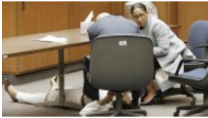
CHP officer found guilty in husband's shooting death