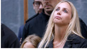
Appeals court asked to decide officer-identity case