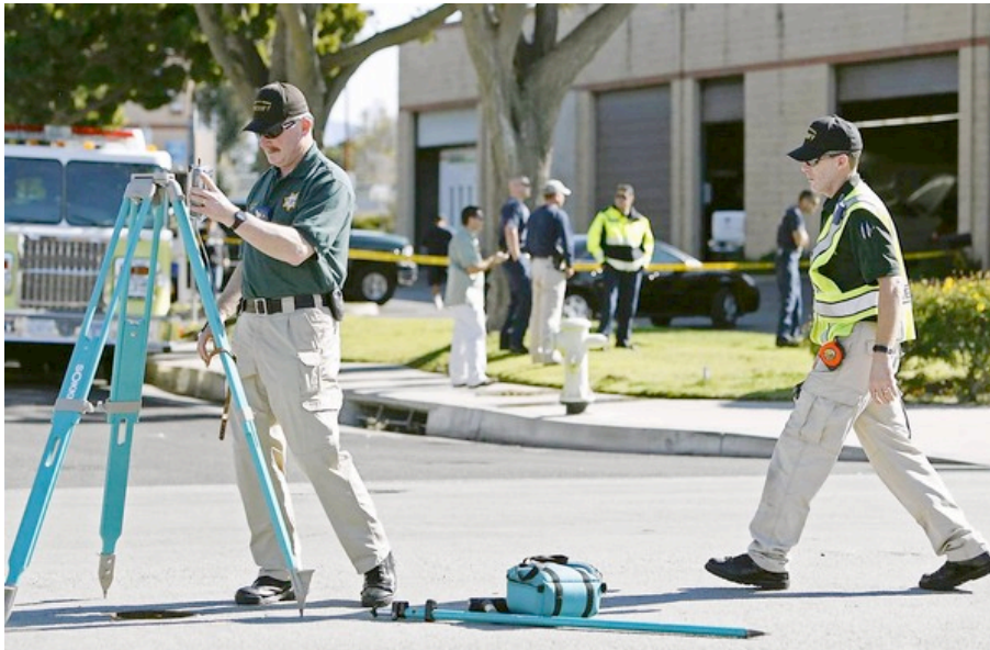
Santa Barbara County sheriff's investigators survey the place where a Santa Maria police officer was fatally shot early Saturday.

Comments 24 Share 92 1 Tweet 5 Recommend 40