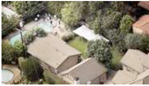
San Marino murder case is talk of the town