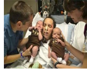
Slideshow: Flesh eating bacteria mom