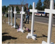
Images: Chaos at the theater