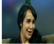
Video: Octomom peddles adult DVD