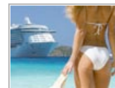
How Cruise Lines Fill All Those Unsold Cruise Cabins