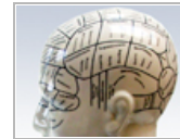
How to Exercise Your Brain to Make It Strong