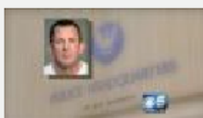
Phoenix officer accused of sex with teen boys