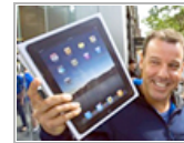
How New iPads are Selling for Under $40