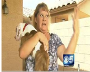
Video: Owl scoops up puppy