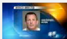
Phoenix police officer accused of having sex with boys