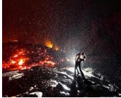
Hottest kiss ever goes viral