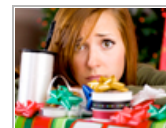
The Secret to Paying No Interest on Your Credit Card Balance