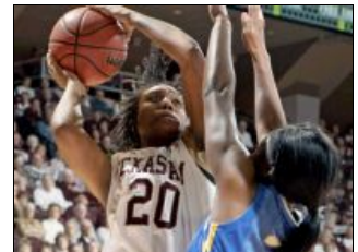
A&M women receive No. 3 seed, to lose assistant coach