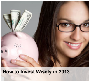
How to Invest Wisely in 2013