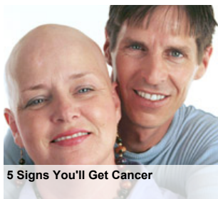
5 Signs You'll Get Cancer