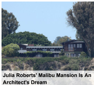
Julia Roberts' Malibu Mansion Is An Architect's Dream