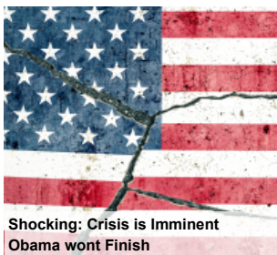
Shocking: Crisis is Imminent Obama wont Finish