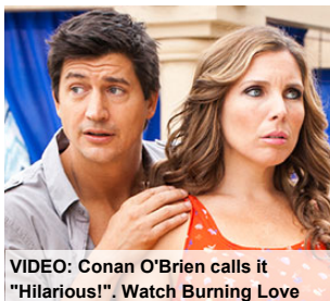
VIDEO: Conan O'Brien calls it "Hilarious!". Watch Burning Love