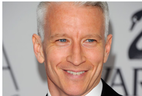
Anderson Cooper and 22 Other Stars Coming Out