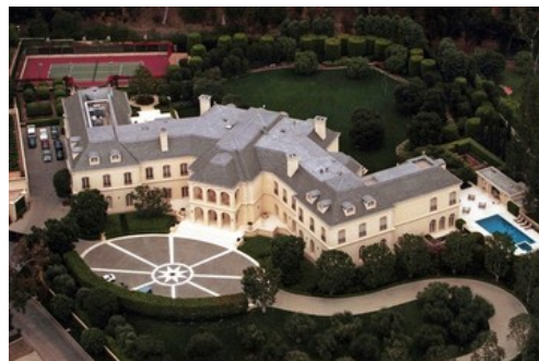
Seriously Awesome Celebrity Homes