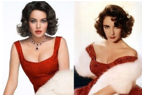
Today's Actresses as Yesterday's Hollywood Icons