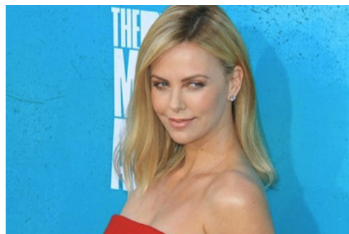
10 Actors Who Are Surprisingly Fluent in Other Languages