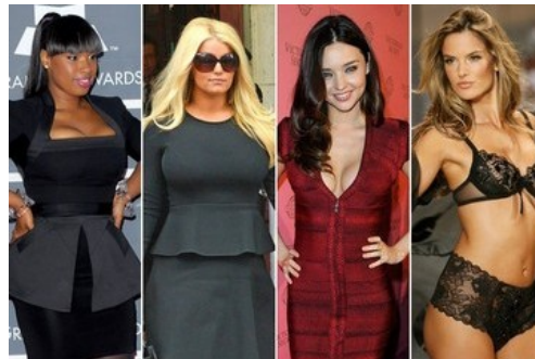
Most Impressive Post-Baby Bods