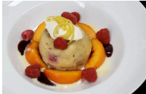
Desserts at the Shore

Call us for privacy policies, terms & conditions or cybersquatting www.gdnlaw.com/internet.htm AdChoices