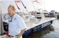
Sept. 6: On this day 5 years ago

The article contains information previously published in the Asbury Park Press.