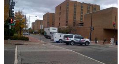
Marine Barracks Employee Struck, Killed by Moving Truck