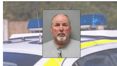
Georgetown Prep Staffer Brought Gun to School: Police