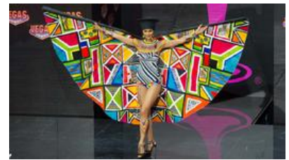
Miss Universe 2013: Contestants in Costume