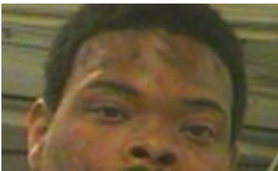
Gwinnett triple homicide suspect captured in New Orleans