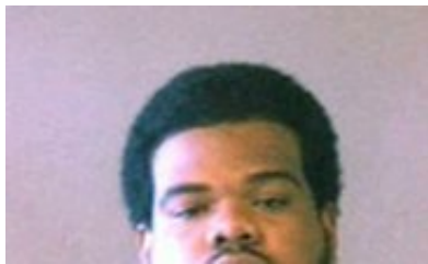
1 charged with murder; one sought in DeKalb triple shooting