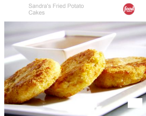
Sandra's Fried Potato Cakes