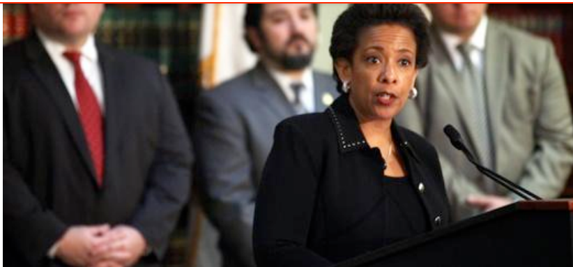
US Attorney Loretta Lynch outlines the sex-trafficking case yesterday

Three Mexican brothers have been extradited and charged with running a vicious sex-trafficking ring that lured girls as young as 14 to the US with promises of love and a new life — only to smuggle them into New York to brutally pimp them out, federal officials said yesterday.