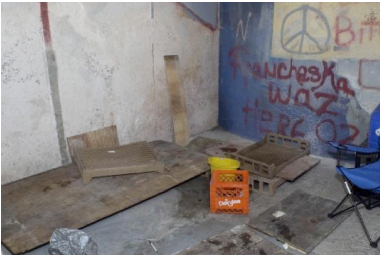
One of the rooms that Jamelske dug out through the wall of his basement contained a crude bed made of wood and a portable chair. The 12-foot by 12-foot room was lit by a single light bulb.

That relationship apparently inspired illicit carnal ideas.