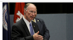
Bentley scores victory in immigration reform law ruling