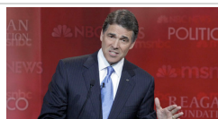
Rick Perry Highlights Record on Job Creation with Infographic