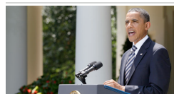
Obama administration prepares to face Supreme Court