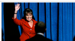
Sarah Palin: Herman Cain is the 'flavor of the week'