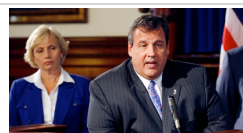
Mitt Romney vs. Chris Christie?