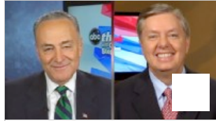
Economy Recovering or 'in a Hole'