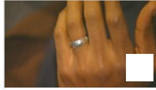
Boy Bling! It's 'Man-gagement' Rings