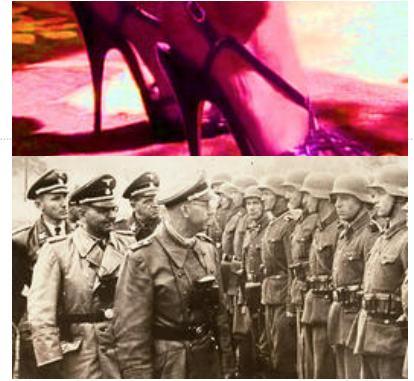
Commander in SS-Led Unit Living in U.S.

That would likely depend on their citizenship status. I see nowhere in the article that