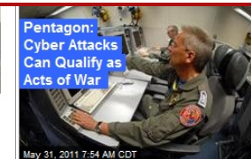
Pentagon: Cyber Attacks Can Qualify as Acts of War May 31, 2011 7:54 AM CDT