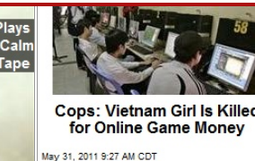
Cops: Vietnam Girl Is Killed for Online Game Money May 31, 2011 9:27 AM CDT