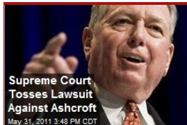
Supreme Court Tosses Lawsuit Against Ashcroft May 31, 2011 3:48 PM CDT