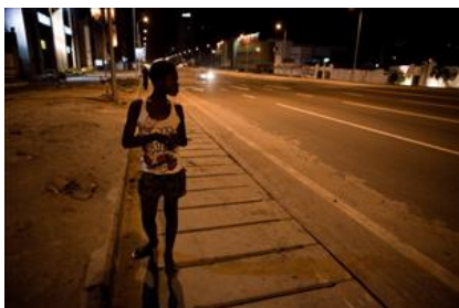
A 13 year-old girl forced into street prostitution walks by a road in Kinshasa on November 7, 2010.

MY TAKE ON THIS STORY: CLICK BELOW TO VOTE