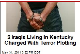
2 Iraqis Living in Kentucky Charged With Terror Plotting May 31, 2011 3:32 PM CDT