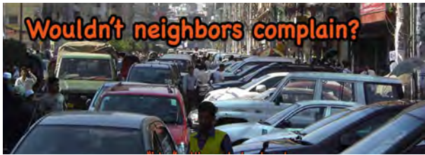
Wouldn't neighbors complain?

WHEN YOU DO THE MATH, THE NUMBERS JUST DON'T ADD UP!